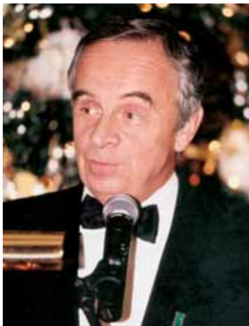
and Italy's Consul General in New York, Minister Antonio Bandini ...