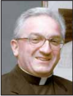
ARCHBISHOP CELESTINO MIGLIORE