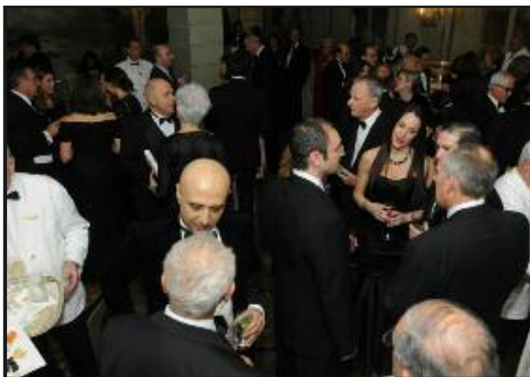
Guests mingle during the cocktail reception in the Garden Foyer of The Pierre Hotel.